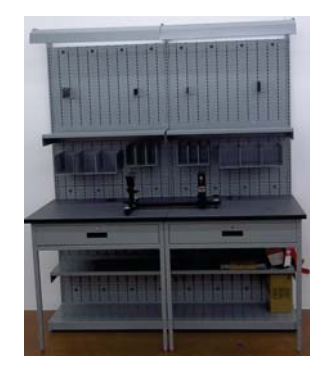
ARMORY WORK BENCH