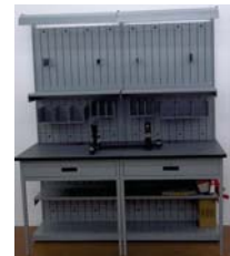
ARMORY WORK BENCH

OUR UNITS COME WITH ALL COMPONENTS INSTALLED. WE HAVE BOTH LEVELING FEET AND ANCHOR HOLES.