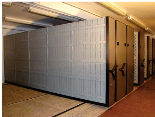
CABINETS ON HIGH DENSITY