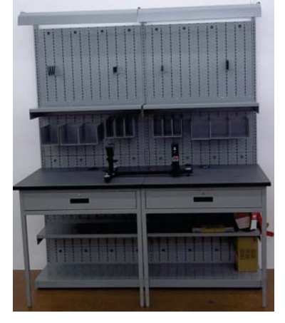
ARMORY WORK BENCH